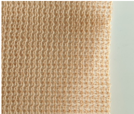
Mono x Mono