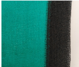
Tape x Tape