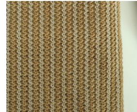
Mono x Tape